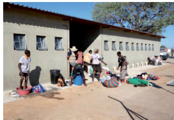
Communal washhouse in Outapi