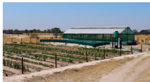
Rainwater harvesting facilities in the village of Epyeshona: household (top) and communal approach (bottom)