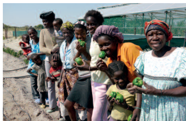
Harvest of green peppers at Epyeshona Green Village