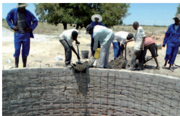
Building an underground tank for rainwater harvesting