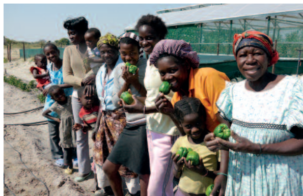
Tava likola ondongu momukunda utwima Epyeshona