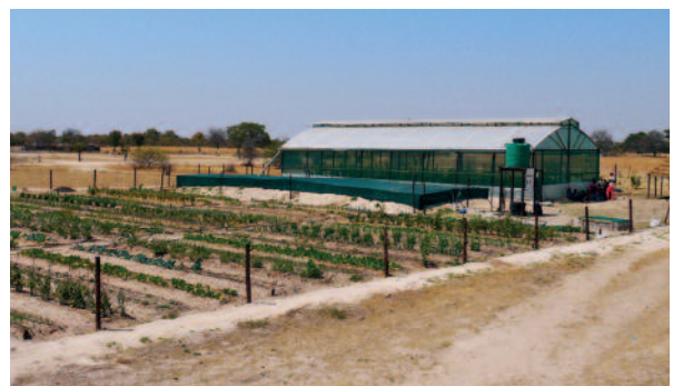
Oihakeli yomeva odula momukunda Epyeshona: Omukalo wopamaumbo (pombada) nomukalo wopashiwana (pedu)