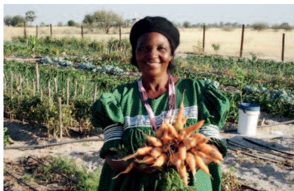
Okulikola ounakamudeshwa momukunda utwima mlipopo