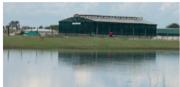
Oshihakelo shomeva efundja mlipopo shili popepi nOshana

woku tekela noumunino, oo hau kwa telepo omeva nohau tandaveleke omeva oo a tuvikilwa keumbo litwima osho yoo koshikunino sha patuluka shili pondje. Eumbo litwima ohali longele kumwe noitopolwa imwe yoshikunino osho shili pondje. Shahala okutya ovanafaalma oha va topolelafana oilonga osho yoo oiuyemo. Ovanafaalama ovena yoo omapiya (manini) avo vene omo hava dulu va likole oilikolomwa yavo yopaumwene ile va kalandife oiimati noikwambidi. Opena ovakainhu omulongo va dja mlipopo nopomikunda do popepi hava limi oikunino ei neumbo litwima, noku kuna mo oikwambidi. Ovanafaalama aveshe okwali va pewa omadeulo nghene edu lina oku longekidwa, oku kuna, oku tulapo oushoshonghee vena oku longifa omeva noukeka. Opo nee ehakelo lomeva li hapupalekwe, omeva odula ohaa hakelwa oku dja pombada yoilambo oyo yee “ponds” osho yoo pombada yeumbo litwima (tala moshifo shomauelel oihakelo yomeva odula moNooli-upokati waNamibia). Oshihakelo shomeya eshi osha twikinikwa yoo komunino wakula womeva (eepomba) opo shi kandulepo omukundu wokuhena omeva omafimbo ale.