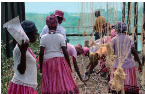
Ovanafaalama vomomukunda utwima lipopo tava kunu